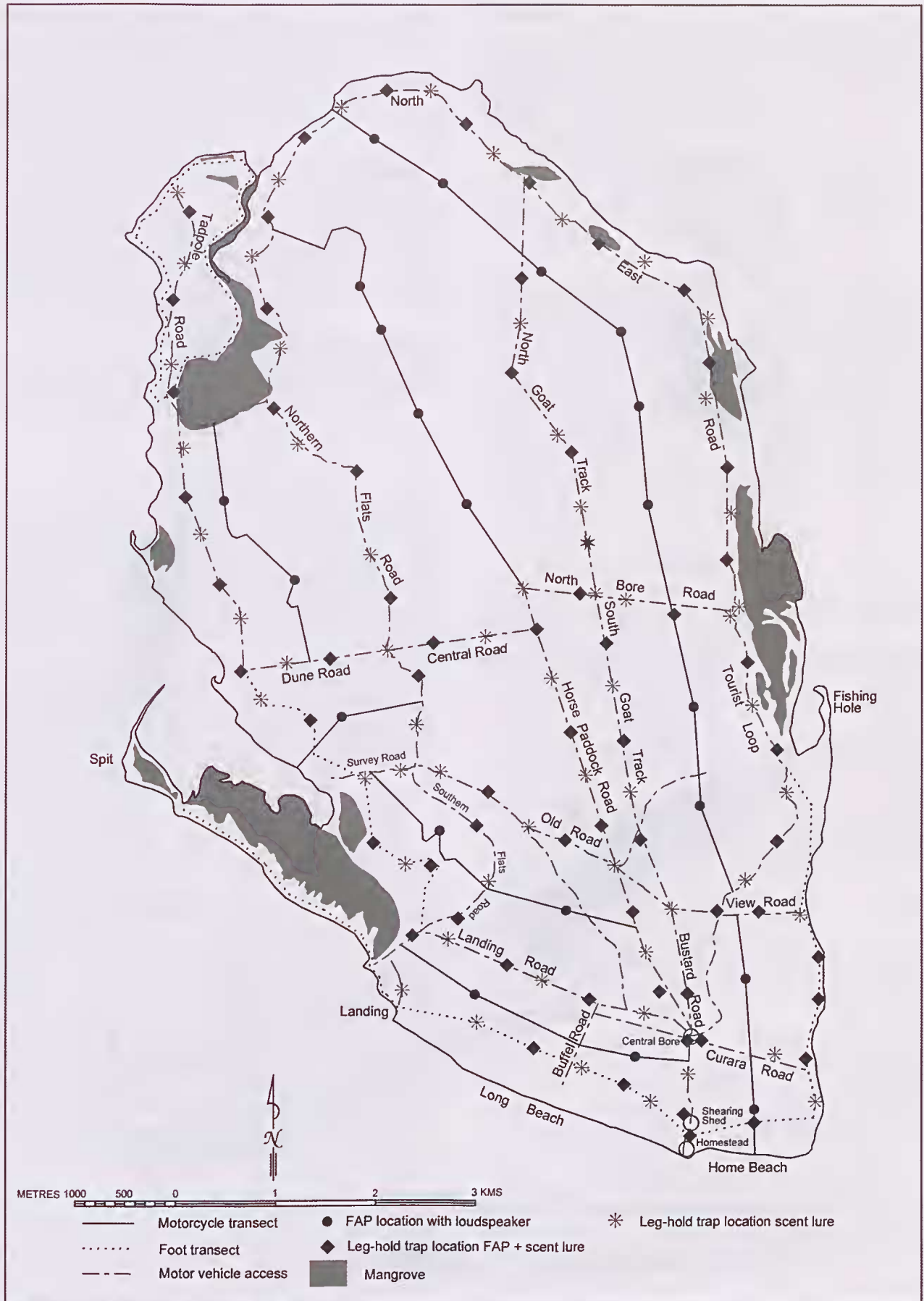
Figure 2. Locations of trap sets, monitoring plots, and transects.